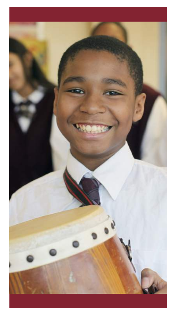
Educational Grants for Inner-City Children at the Mount Carmel-Holy Rosary School in East Harlem